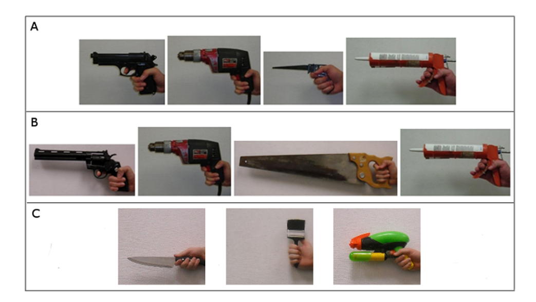
Figure 2. Stimuli. Panel A: In Study 1, participants rated the height and size of men holding a .45 caliber handgun, a drill, a small handsaw, and a caulking gun. Panel B: In Study 3, participants rated the height, size, and muscularity of men holding a .357 caliber handgun, a drill, a large handsaw, and a caulking gun. Panel C: In Study 5, participants rated the height, size, and muscularity of men holding a kitchen knife, a paintbrush, and a toy squirt gun. In Study 2, participants rated the potential lethality of the objects shown in Panels A and B. In Study 4, participants rated the potential lethality of the objects shown in Panels A and B. In Study 4, participants rated the potential lethality of the object. Photographs, presented to participants in color, were resized so that the objective dimensions of each hand displayed on the participant's computer screen remained constant across all images. doi:10.1371/journal.pone.0032751.g002

advertised in the U.S., and enjoying commercial success, at the time that these studies were conducted).